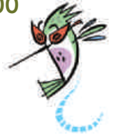
Table Sponsors - $5,000

J. P. Morgan Chase Total Wine & More Tucson Electric Power Company