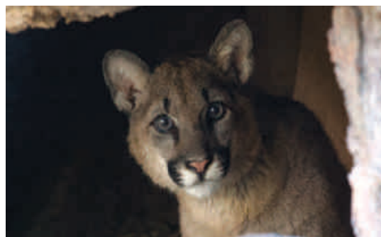
Retired mountain lion (L.) and new mountain lion cub (R.), photographed by Rhonda Spencer in the same location in the lion enclosure.